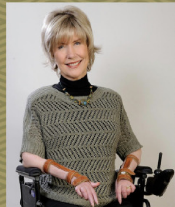
— Joni Eareckson Tada

"I have learned to... season my prayers with the word of God . It's a way of talking to God in his language – speaking his dialect, using his vernacular, employing his idioms...This is not a matter simply of divine vocabulary. It's a matter of power. When we bring God's word directly into our praying, we are bringing God's power into our praying. Hebrews 4:12 declares, "For the word of God is living and active. Sharper than any double-edged sword." God's word is living, and so it infuses our prayers with life and vitality. God's word is also active, injecting energy and power into our prayer."